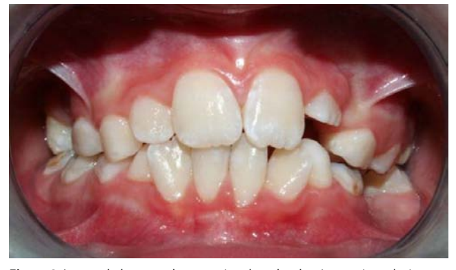
Figure 3. Intraoral photograph presenting dental arches in centric occlusion