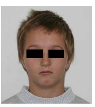
Figure 1. Extraoral photograph presenting characteristic facial features

Clinical examination, extraoral and intraoral photographs (Fig. 1, 2, 3), orthopantomograph (Fig. 4) and a lateral cephalometric radiograph were performed (Fig. 5). The physical examination revealed typical facial dysmorphic features of ATS: broad forehead, triangular shape of the face, hypertelorism, microstomia, low-set ears, mandibular retrognathia and convex facial profile. Intraoral examination revealed: high-arched palate, crowding in the dental arches, hypomineralisation of the enamel of permanent teeth and high incidence of dental caries. Dental age assessment by Demirijan indicated delayed development of the permanent dentition. Cephalometric analysis by Segner and Hasund revealed skeletal class II with mandibular retrognathism and high angle vertical jaws relation.